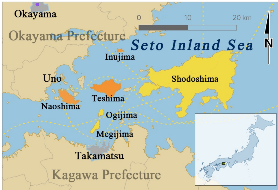
Fig 1. Map showing six Setouchi Triennale art islands and nearby ports, Source of the map:(Geospatial Information Authority of Japan (GSI), 2016), Software: (QGIS Development Team, 2025), Author's illustration.

Naoshima, Teshima, Inujima, Ogijima, and Megijima systematically. Due to its status as a well-established tourism hub, Shodoshima is omitted from the scope of this research. Consequently, this study focuses on the other major Triennale destinations that experience significant visitation spikes yet face more precarious development conditions.